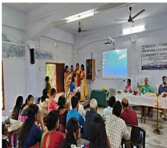
Opening song performed by the students in the workshop