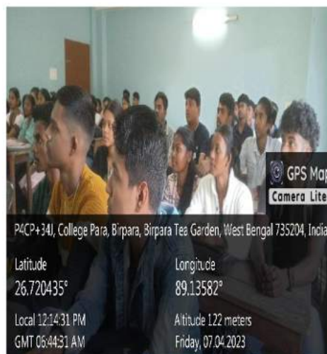
Student participation in the seminar