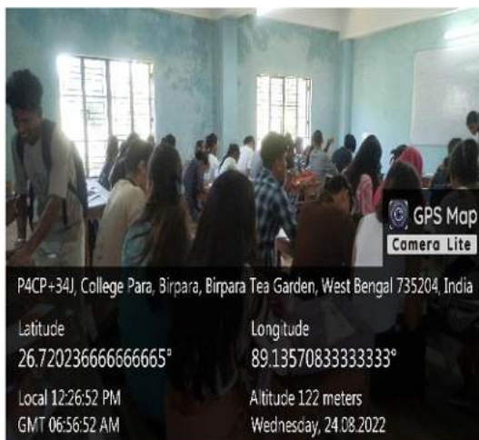
Students' participation in the workshop