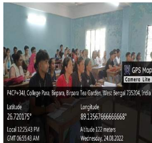
Students participation in the workshop

Kanstav Chakraborti Principal Birpara College Birpara, Alipurduar