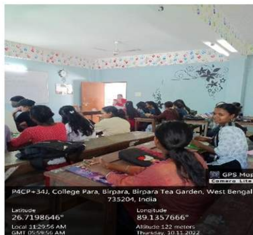
Student participation in the seminar