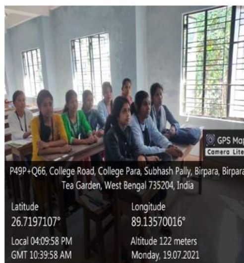
Student participation in the workshop