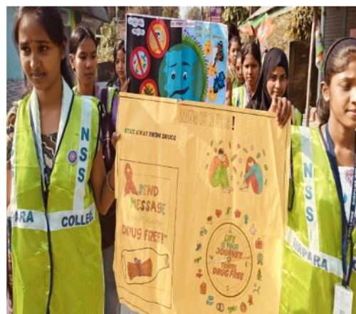
NSS Unit II Volunteers at Health Awareness Rally on Drug Abuse