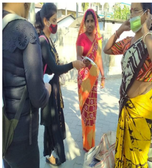
Covid awareness at Birpara Market by NSS unit II volunteers