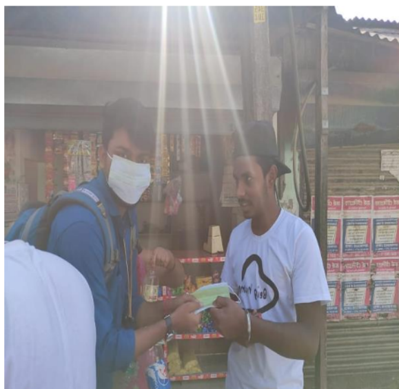
Covid awareness at Birpara Market by NSS unit II volunteers