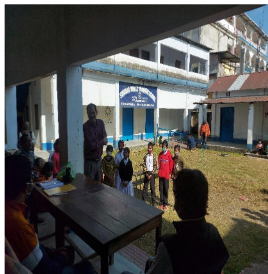
Literacy awareness Programme at Subhaspally Primary School by NSS unit II volunteers