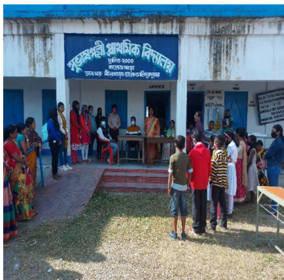
Literacy awareness Programme at Subhaspally Primary School by NSS unit II volunteers