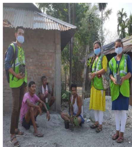
Tree plantation by NSS Unit II volunteers