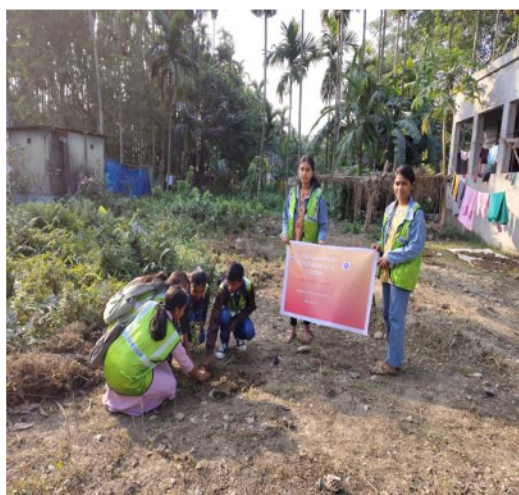
Tree plantation by NSS Unit II volunteers