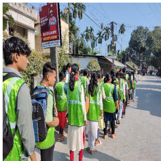
Awareness rally on Tobacco use by NSS unit II volunteers