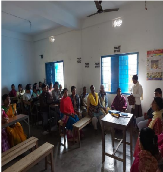
Health Awareness at Birbiti primary school by NSS II volunteers