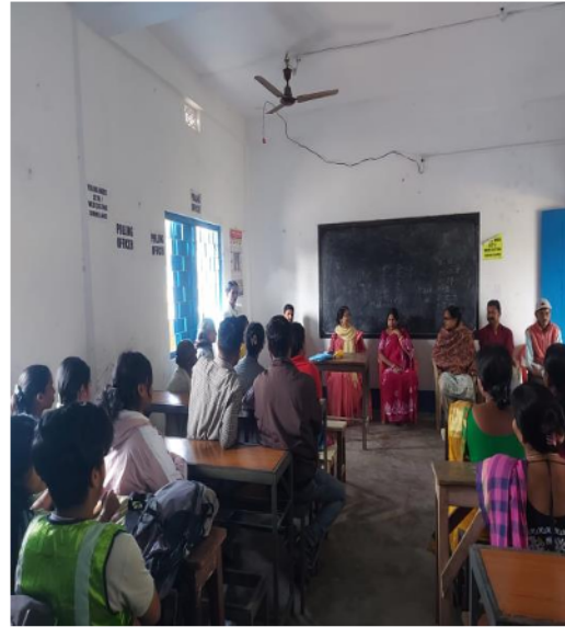
Health Awareness at Birbiti primary schhol Area by NSS II volunteers