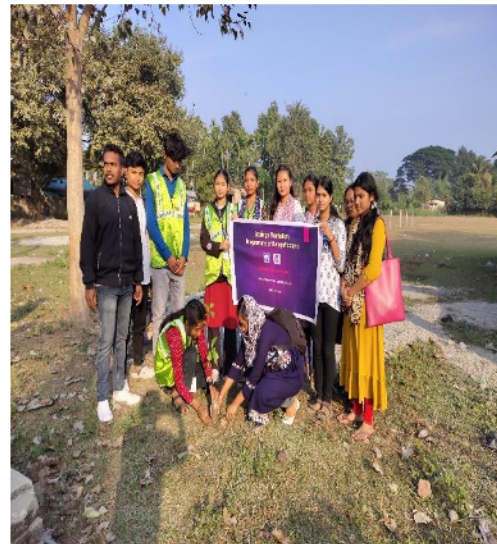
Sapling plantation programme at Rangalibazna Area