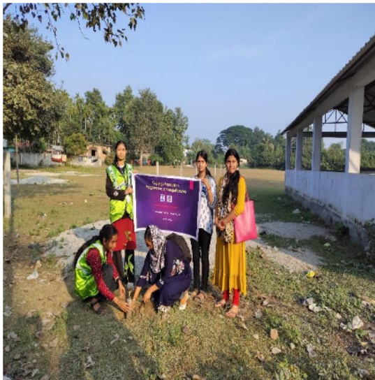
Sapling plantation programme at Rangalibazna Area