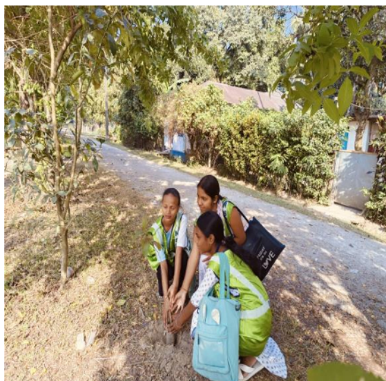
Sapling plantation at new line area by NSS unit I volunteers

The programme commenced with a brief inaugural session where the significance of tree plantation was highlighted. Faculty members, NSS volunteers, and local community representatives participated actively. Volunteers were divided into teams to plant the saplings systematically while ensuring proper spacing and soil preparation. Participants were also instructed on maintaining and monitoring the growth of the planted saplings.