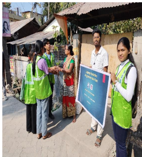
Sapling distribution to the local residents of new line area by NSS unit I volunteers