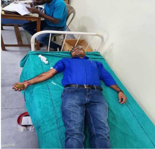
Resident of Birpara donated his blood at camp