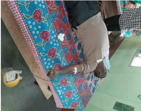
Resident of Birpara donated his blood at camp