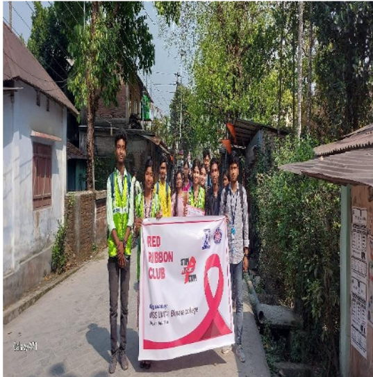
Rally on awareness on HIV & AIDS by NSS Unit I volunteers