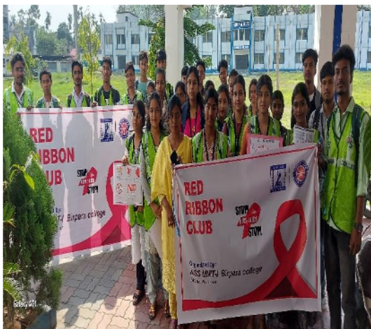
NSS Unit I volunteers before Rally Start