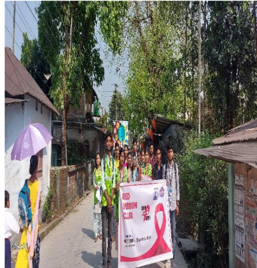
Rally on awareness on HIV & AIDS by NSS Unit I volunteers