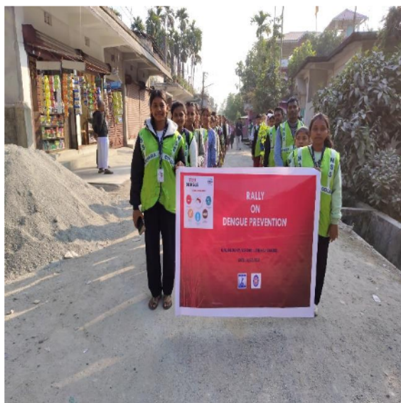
Rally on Dengue Prevention Measures at locality by NSS Volunteers