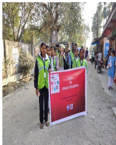
Awareness regarding Dengue by NSS Volunteers