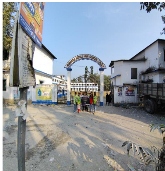
Volunteers in front of Birpara Nepali School after the plantation