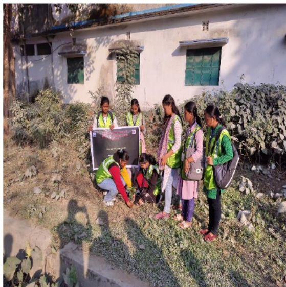
Tree plantation at Birpara Nepali High School by NSS Unit II volunteers