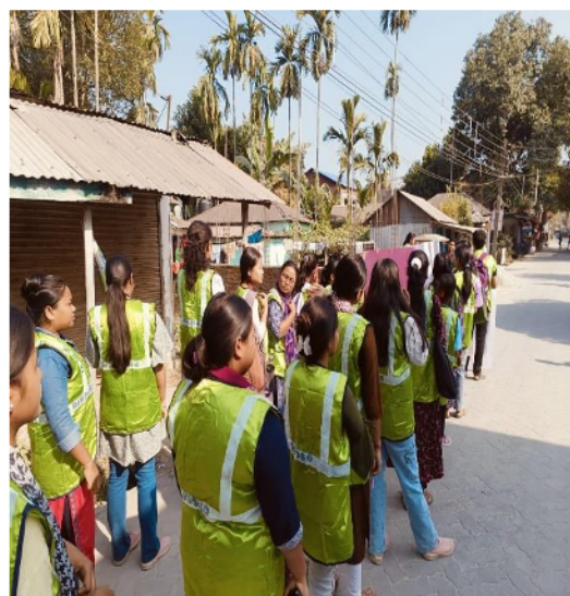
Rally on Stop Animal Cruelty by NSS II volunteers