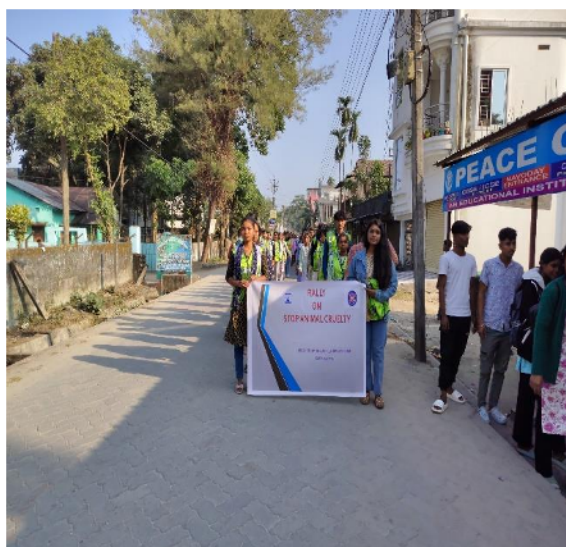
Rally on Stop Animal Cruelty by NSS II volunteers