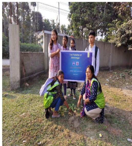
Tree plantation at Bhanunagar area by NSS Unit I Volunteers