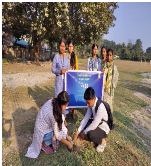
Tree plantation at Bhanunagar area by NSS Unit I Volunteers