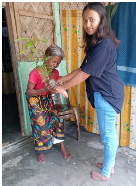
NSS Volunteers Distributing Saplings to the Residents