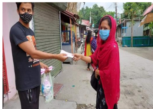
NSS Volunteers distributing Masks to the Residents