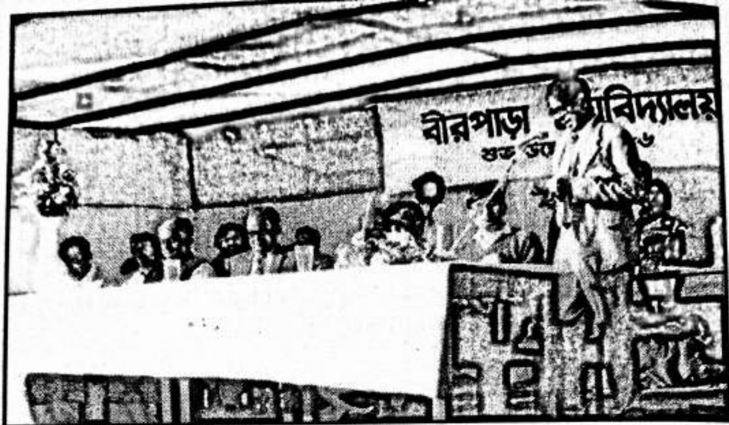
A meeting held on the proposed campus of Birpara College in 1986.