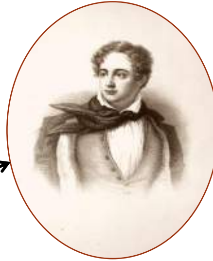
Lord Byron (1788-1824), one of the young Romantics

The following fragment is here published at the request of a poet of great and deserved celebrity, and, as far as the Author's own opinions are concerned, rather as a psychological curiosity, than on the grounds of any supposed poetic merits.