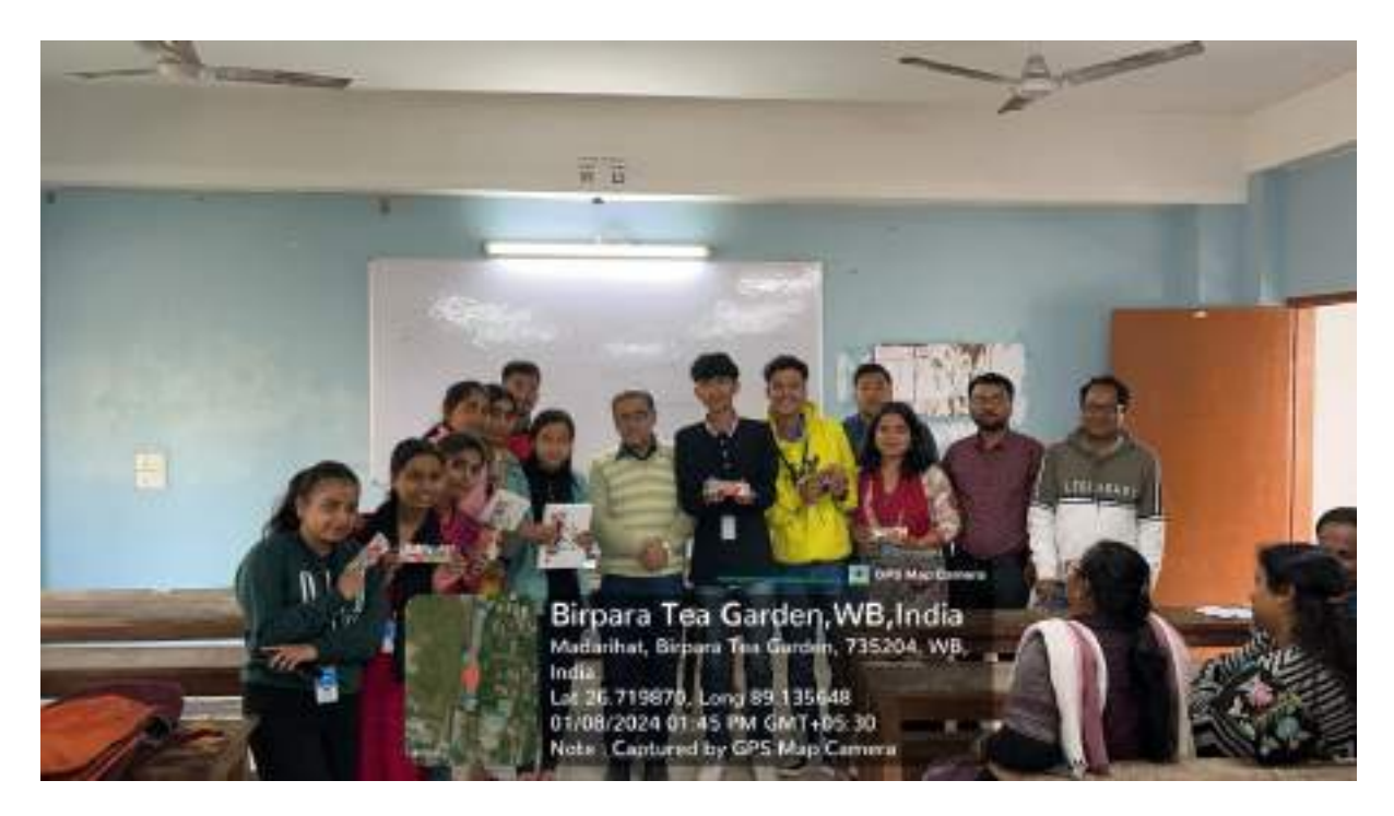
Celebration of Students' Week with Students and Faculty Members

The college has a fairly good student diversity, and is gender sensitive. There are separate facilities for men and women students. Student intake is predominantly from tea garden workers and other under privileged groups. The vision of the college is holistic development of the students and the mission is that of inclusiveness and sustainable growth taking into account all the social and economic parameters.