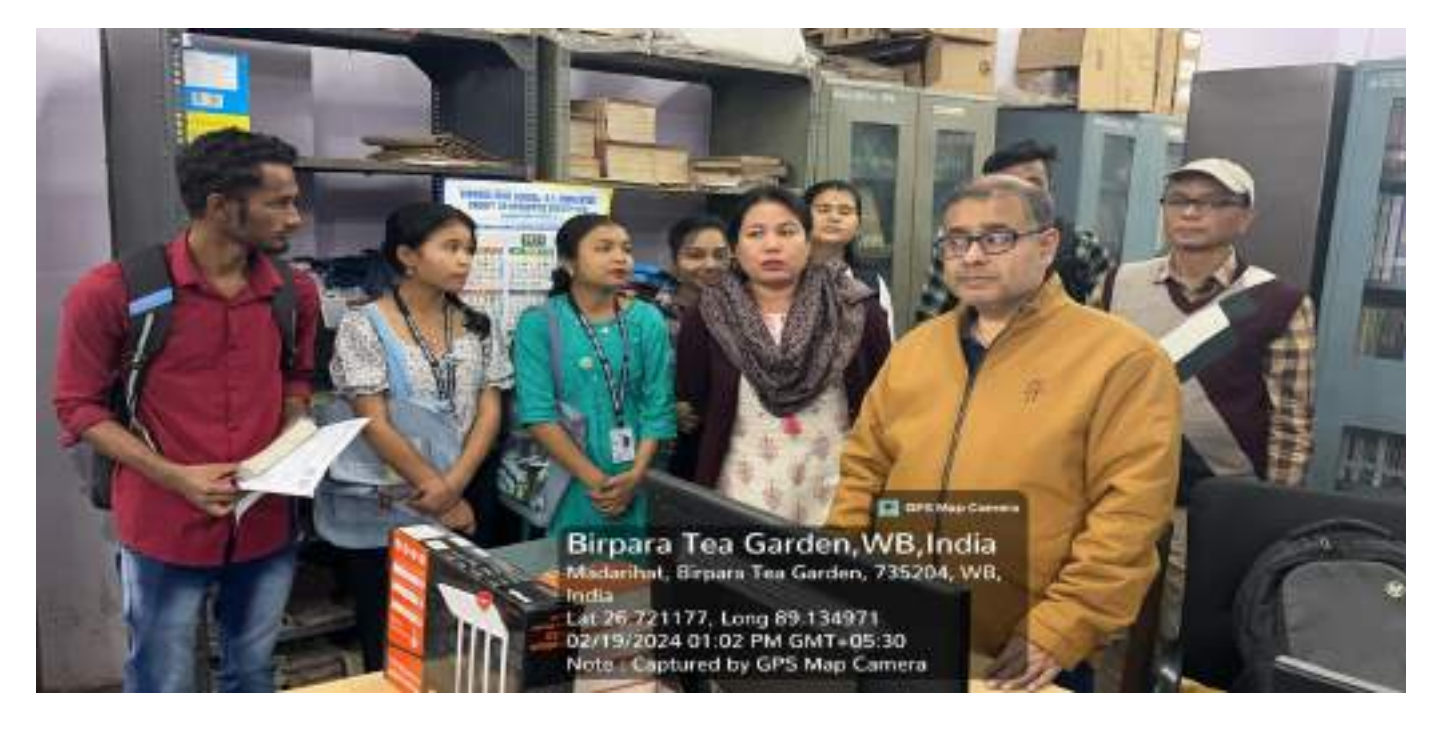
Old Library Premises

The College has constructed a brand-new library with a capacity for books and journals. The library has a reading corner for the faculty in addition to providing adequate reading space to the students. Besides academic books and journals, the library also has provisions for newspapers and periodicals in order to prepare students for various competitive exams.