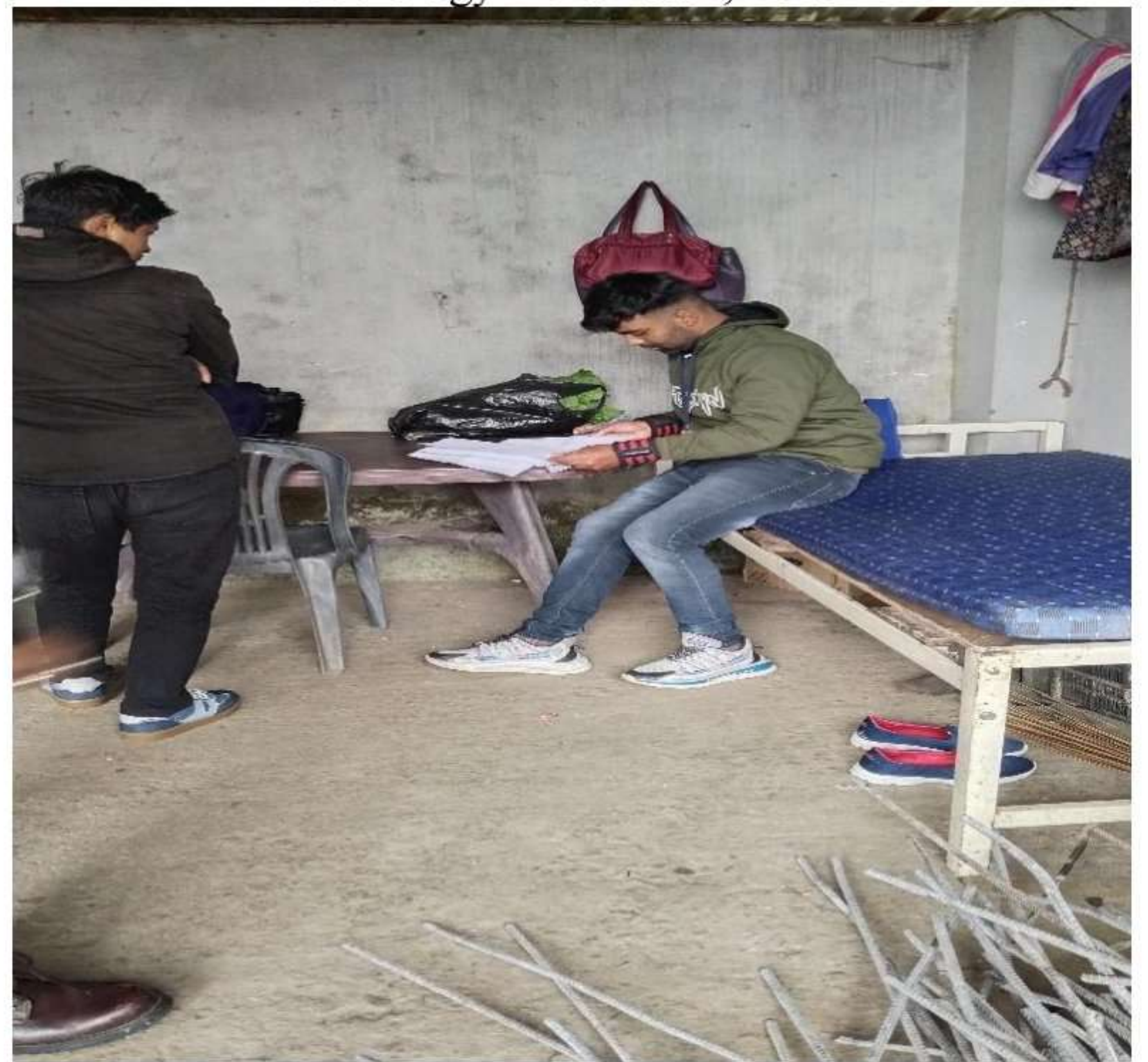
Sociology Field Survey Picture, 2025