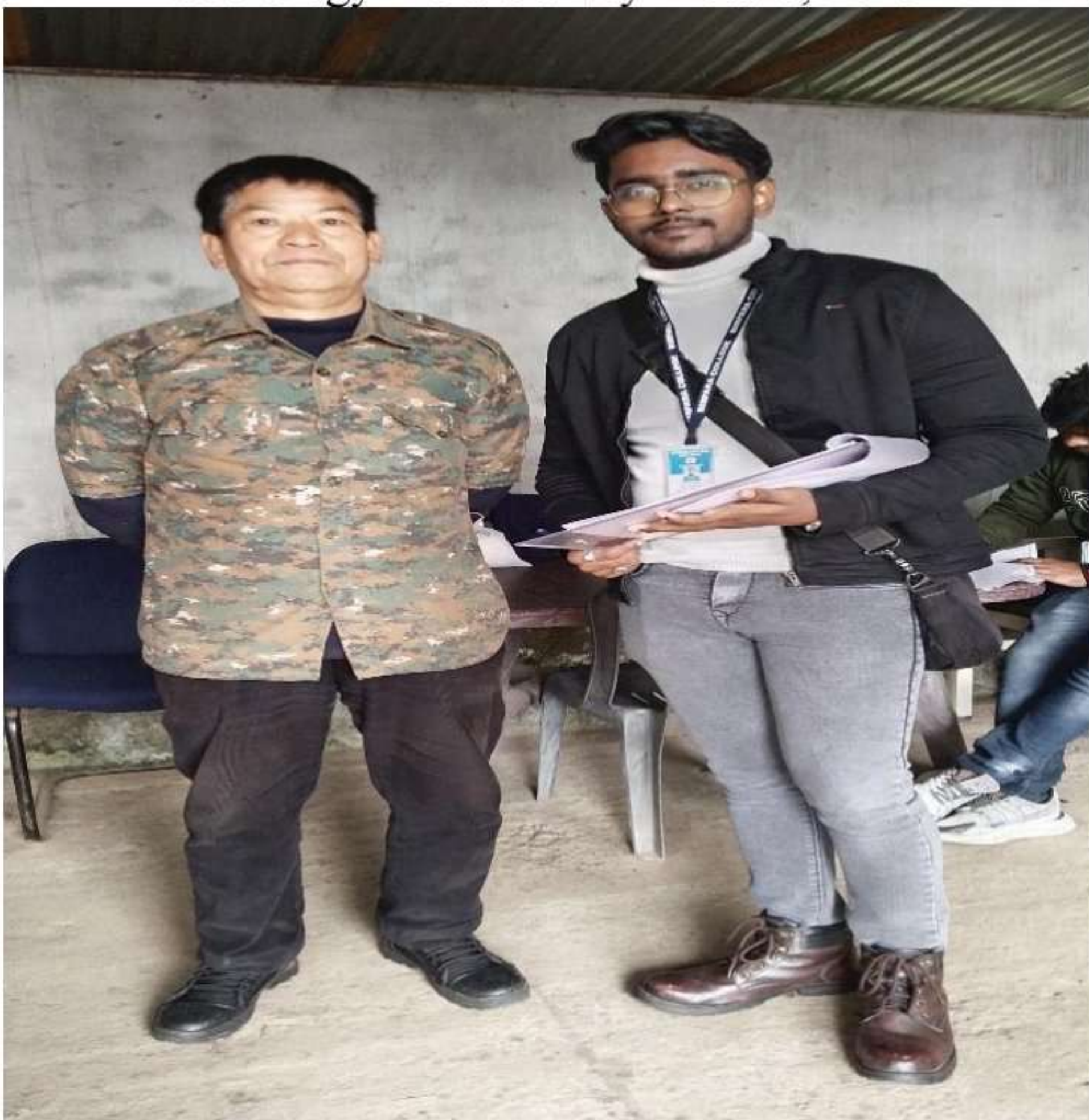
Sociology Field Survey Picture, 2025