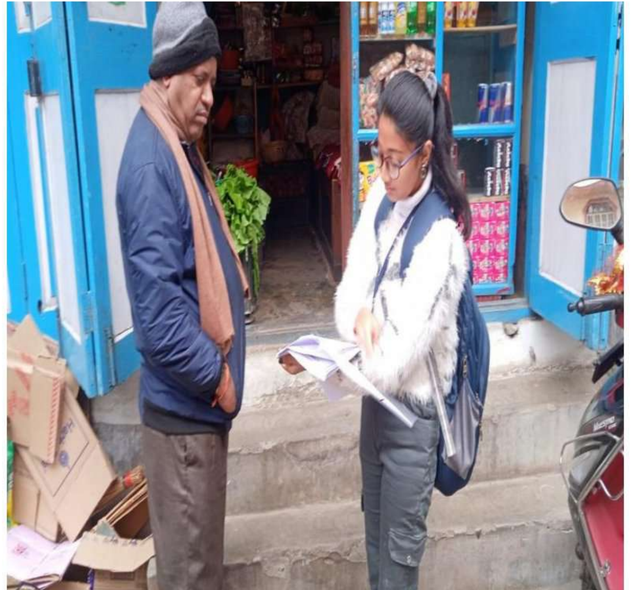
Sociology Field Team, 2025