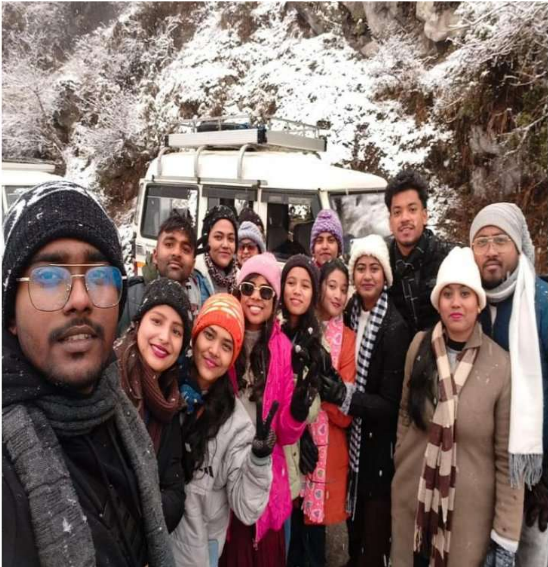
Sociology Field Survey Picture, 2025